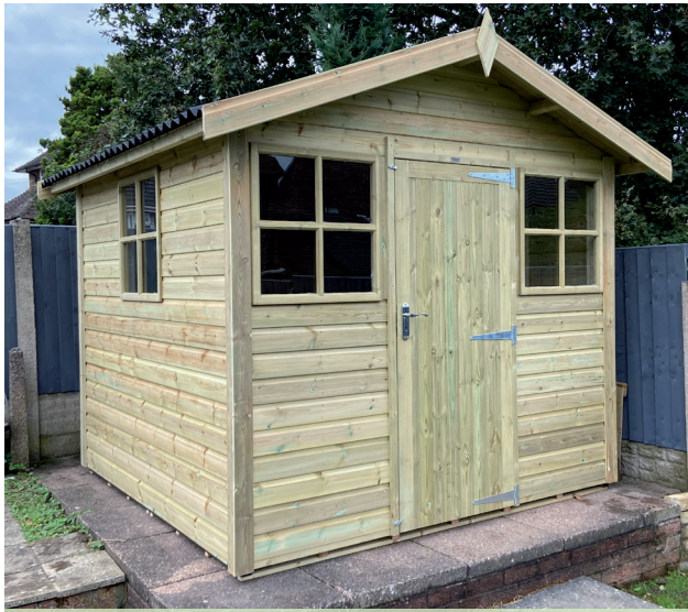
hobby garden shed